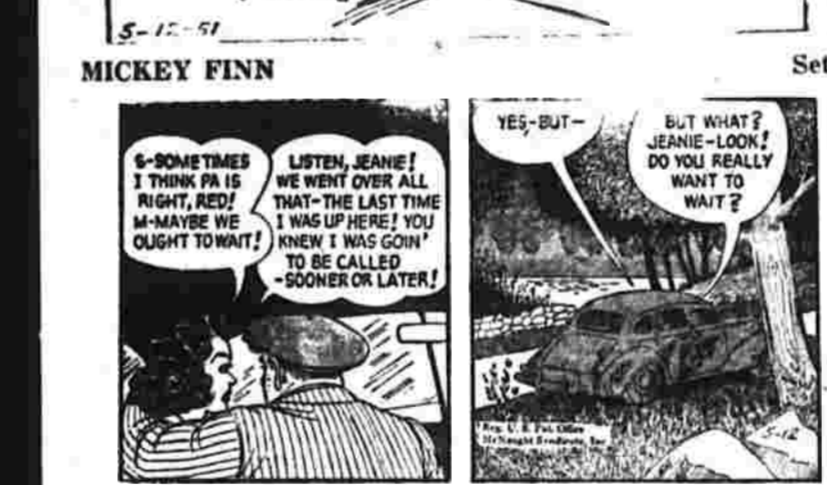
YES-BUT... BUT WHAT? JEAN-LOON! YOU WANT TO WAIT?