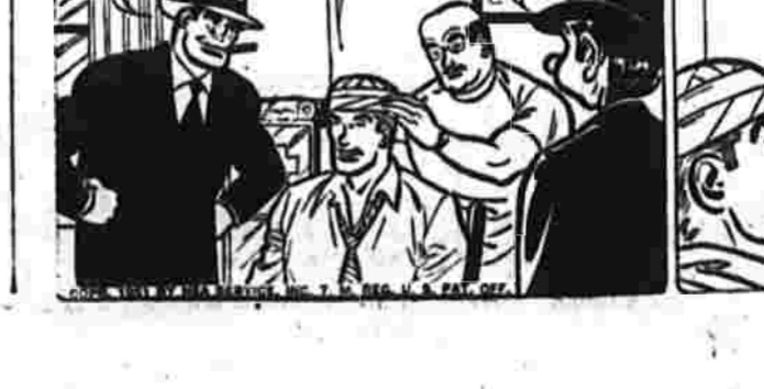
"DO YOU THINK I'M A TERRIBLE?"