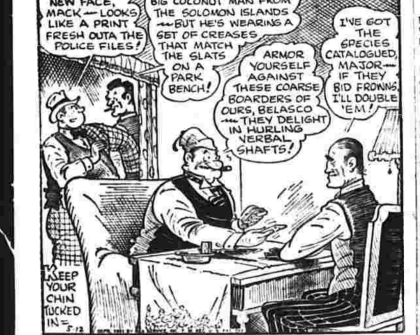
THE MAJOR SAYS HE'S A BIG COONUT MAN FROM THE SOLOMON ISLANDS