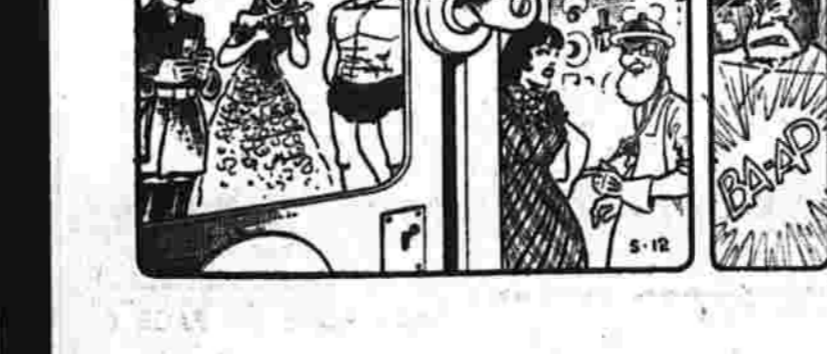
DOCTOR, I THINK I'M DYING! I'VE GOT TO GO!