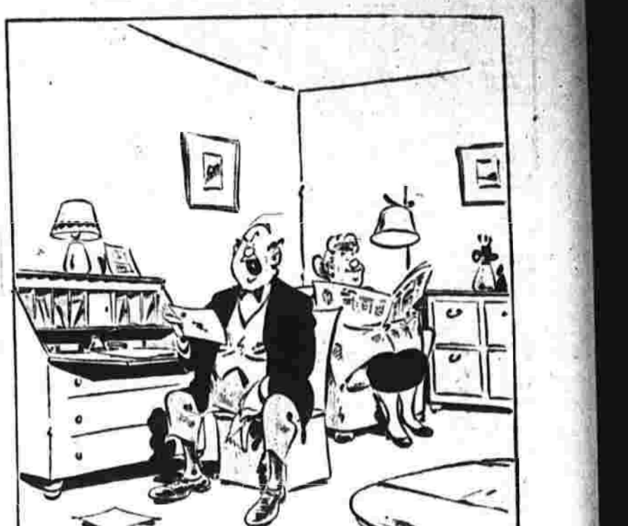
"WONDERFUL! YOU'D BE A WESTERN! WE'VE BOUGHT YOU A SADDLE, AN AWK TOOK US ON THE SWAN!"