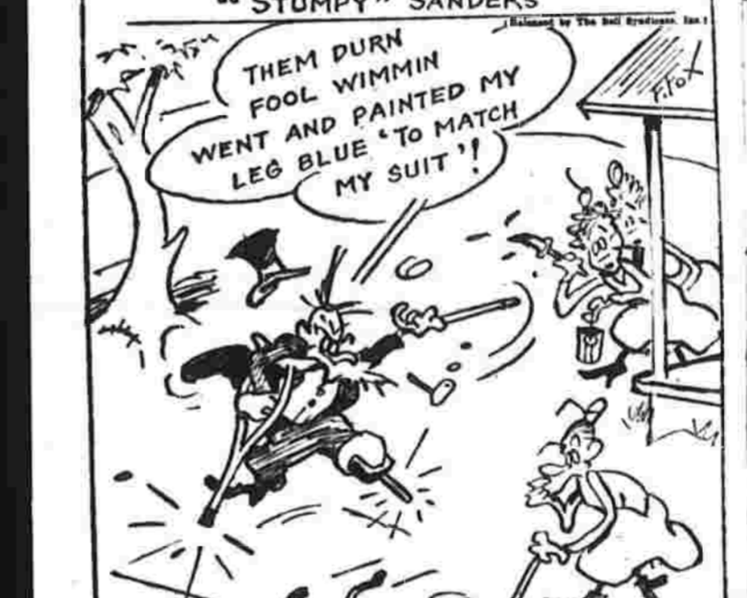
THEM DURN FOOL WINNIN' WENT AND PAINTED MY LEG BLUE 'TO MATCH MY SUIT'