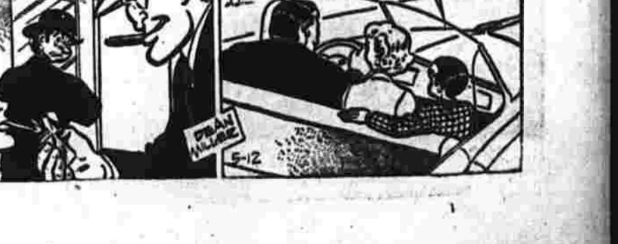
"LET ME REMIND YOU, INSPECTOR SEWELL, THAT SUCH AS YOU WILL BECOME A PUBLIC SERVANT."