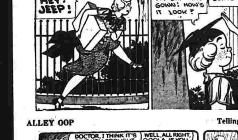
MY CAP AND GUNNYS' MOWNS IT LOOKS?